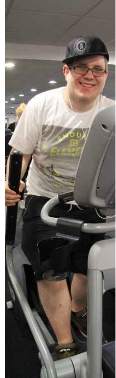
cont. page 10